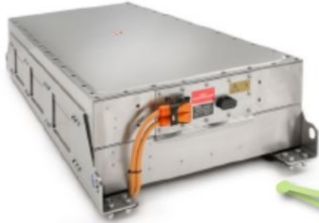
4 battery packs of 66 kWh (600V)