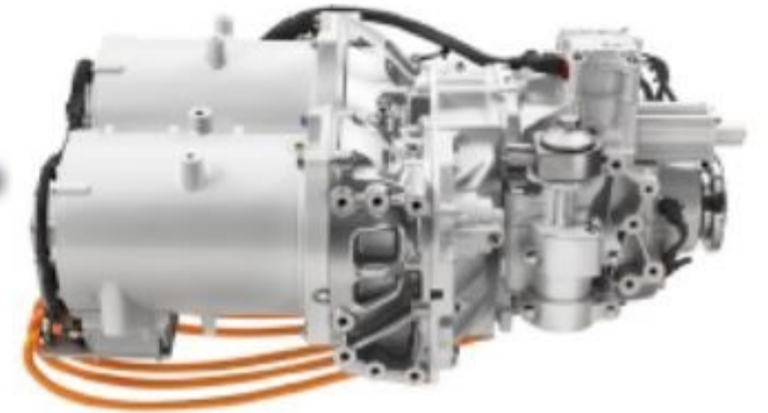
Electric motors & Gearbox